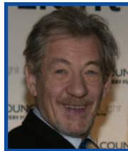
Sir Ian McKellen

OK, that's a good start, but we need to know more! Preparations for the 2006 ceremony have just begun. First Light wants to hear from you. Send your comments to info@firstlightmovies.com